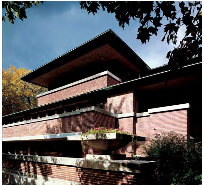
The Frederick Robie House - Chicago, Illinois - 1908. This house is often considered to be Wright's Prairie Era masterpiece. The client was an inventor and engineer who had specific requirements for the design. They include: a fireproof building, rooms without interruptions, all the daylight possible with shading and weather protection provided by overhanging eaves, the ability to see down the street to the neighbors with his own privacy ensured, and a walled yard to keep children from wandering off and getting lost.