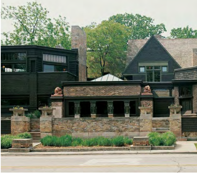
The Oak Park Home and Studio - Oak Park, Illinois - 1890-1909. Wright's own home and studio became an architectural laboratory during the nineteen years that he lived and worked there. Built in the same neighborhood as several of his other houses, it was a showroom of his ideas. In 1890 he placed lighting within a ceiling grille, creating the first use of what would be known as "indirect lighting."