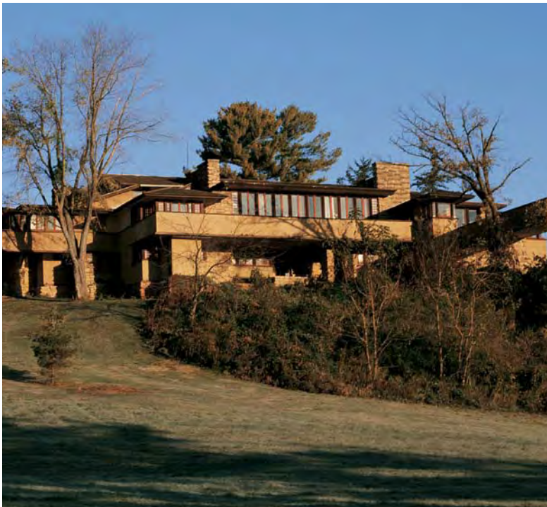
Talesin - Spring Green, Wisconsin - 1911-1959. Wright began building Talesin, his home, studio, and farm, in 1911. The name Talesin in Welsh and means "shining brow." The building rests on the brow of a hill overlooking the fields, lakes, and hillsides of the pastoral Wisconsin landscape. As with his previous home in Oak Park, Talesin continually grew and expanded over the course of fifty years. It differs from the previous Prairie Houses, which were mostly in urban settings, in that it is an intimate companion to the land on which it is constructed.