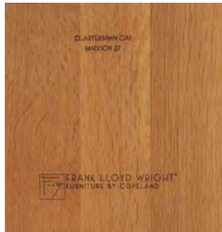
Madison Oak (27)