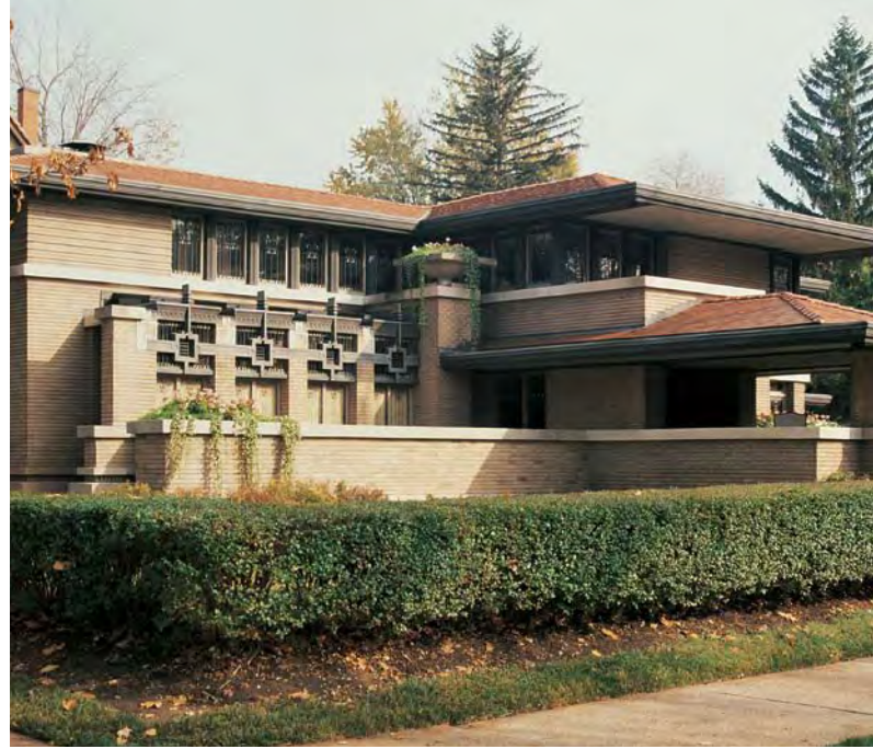
The Meyer May House - Grand Rapids, Michigan - 1908. Along with the design of the home of Meyer May, a cutting-edge haberdasher, Wright designed furniture, rugs, stained glass, ornamental fixtures and textiles. It stands today as one of the finest examples of all those elements harmoniously combined.