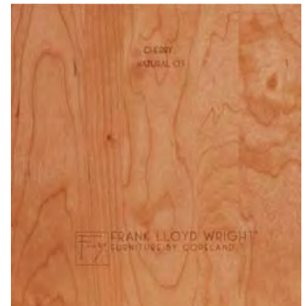
Natural Cherry (03)