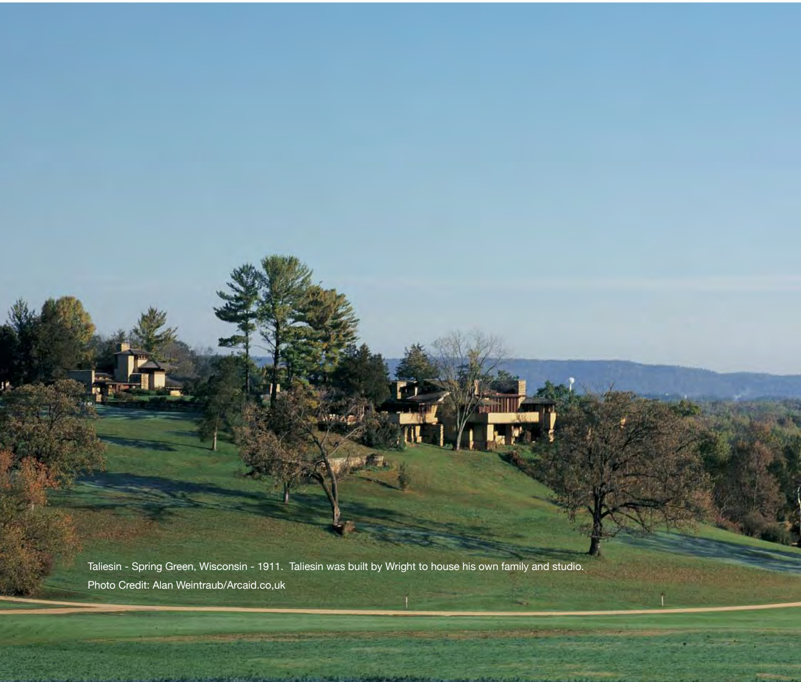
Taliesin - Spring Green, Wisconsin - 1911. Taliesin was built by Wright to house his own family and studio.