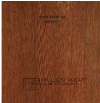
Parkton Oak (17)

Frank Lloyd Wright® Furniture by Copeland is available in Parkton Oak (17), Madison Oak (27), Parkton Cherry (13) or Natural Cherry (03) finishes.